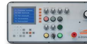
K-tronic control panell

We offer no standard control to our customers. Our machines do not work with complicated expiries and symbols which nobody knows.